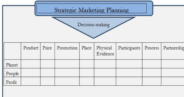
The Strategic Sustainability Marketing Framework

Group exercise: The trainees could discuss and fill in the Matrix for a certain product such as Coffee, sugar, cacao.